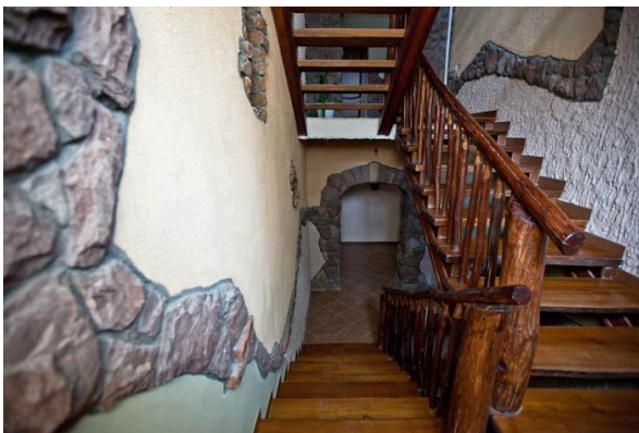
Pic. 6: Stairs in the hotel