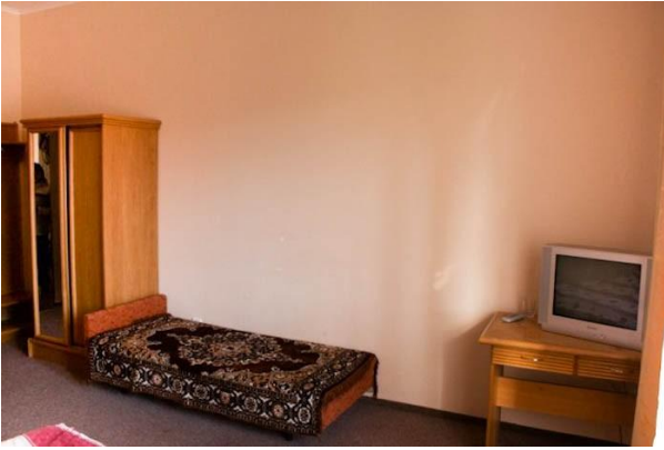
Pic. 2: Sleeping-room