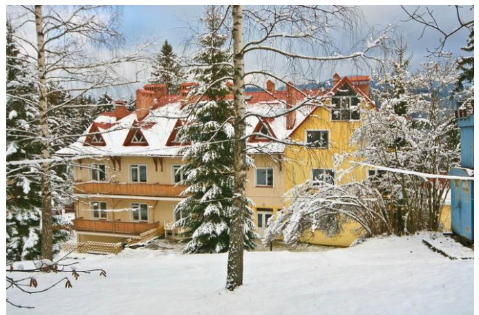
Pic. 1: Hotel "Stariy Lemberg"