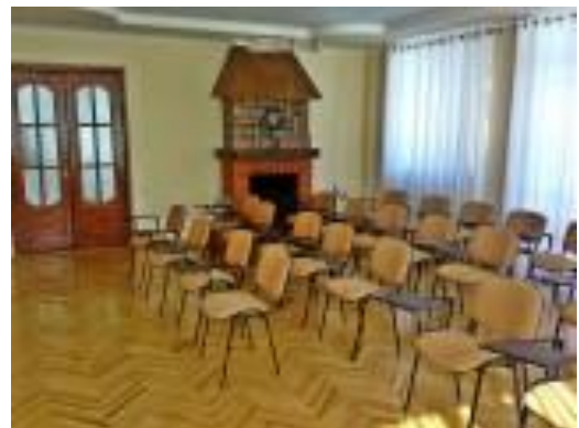
Pic. 7: Conference room