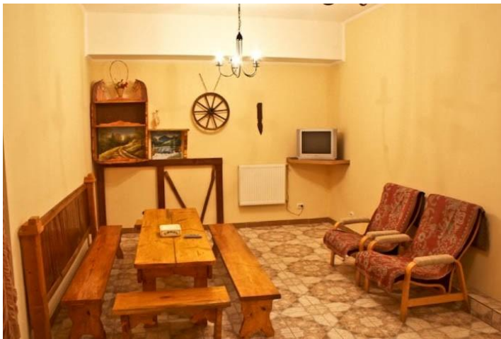
Pic. 4: Tee ceremony hall