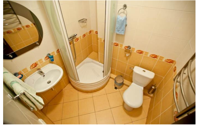
Pic. 3: Bath-room