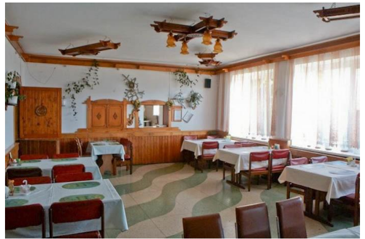
Pic. 5: Dining hall